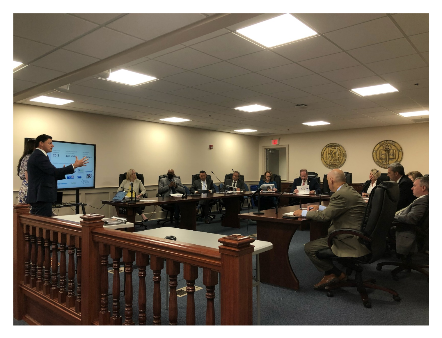
Leaders from Unite Us describing technological solutions for connecting services.